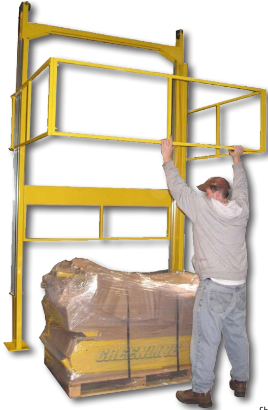
Shown: PG-04-CA, Single-Pallet Model