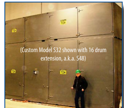
(Custom Model S32 shown with 16 drum extension, a.k.a. S48)

* Class A ovens available for heating flammables.