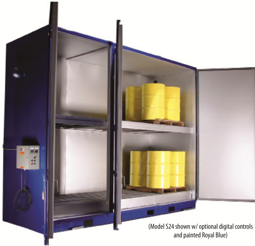
(Model S24 shown w/ optional digital controls and painted Royal Blue)

The Benko Products SAHARA HOT BOX drum heaters and ovens are recognized as the industry leader in 55-gallon drum heating equipment. Steam drum heaters are available with state-of-the-art digital controls with independent over-temperature protection. Units in a manifolded arrangement can be individually turned off when not heating, perfect for your drum storage and drum heater needs.