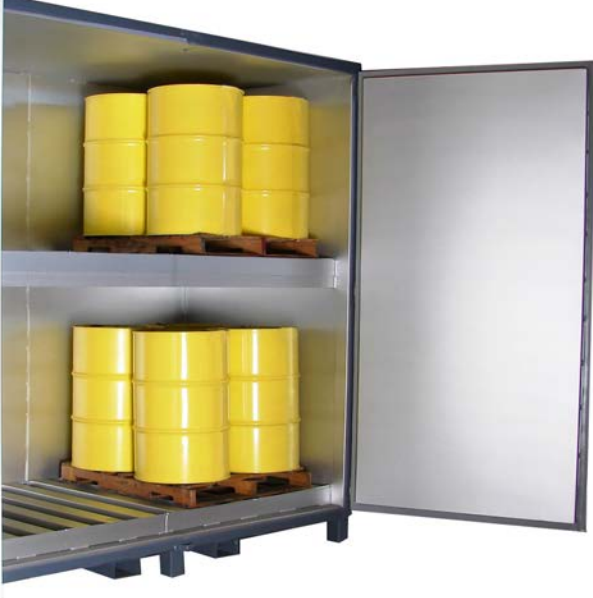
(Model S16 shown w/ optional digital controls and blower)