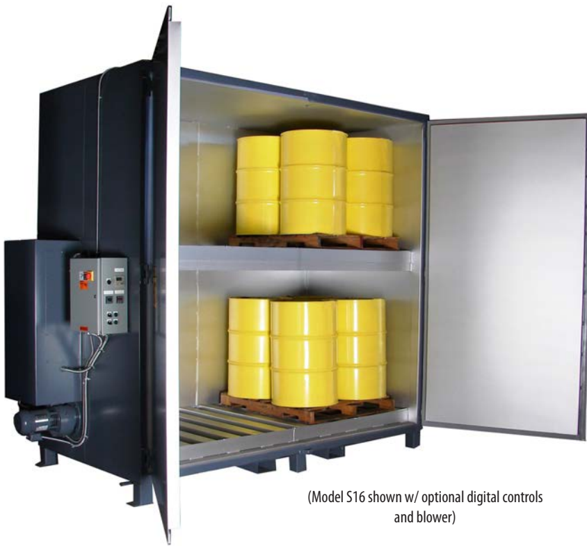
(Model S16 shown w/ optional digital controls and blower)

The Benko Products SAHARA HOT BOX drum heaters and ovens are recognized as the industry leader in 55-gallon drum heating equipment. Steam drum heaters are available with state-of-the-art digital controls with independent over-temperature protection. Units in a manifolded arrangement can be individually turned off when not heating, perfect for your drum storage and drum heater needs.